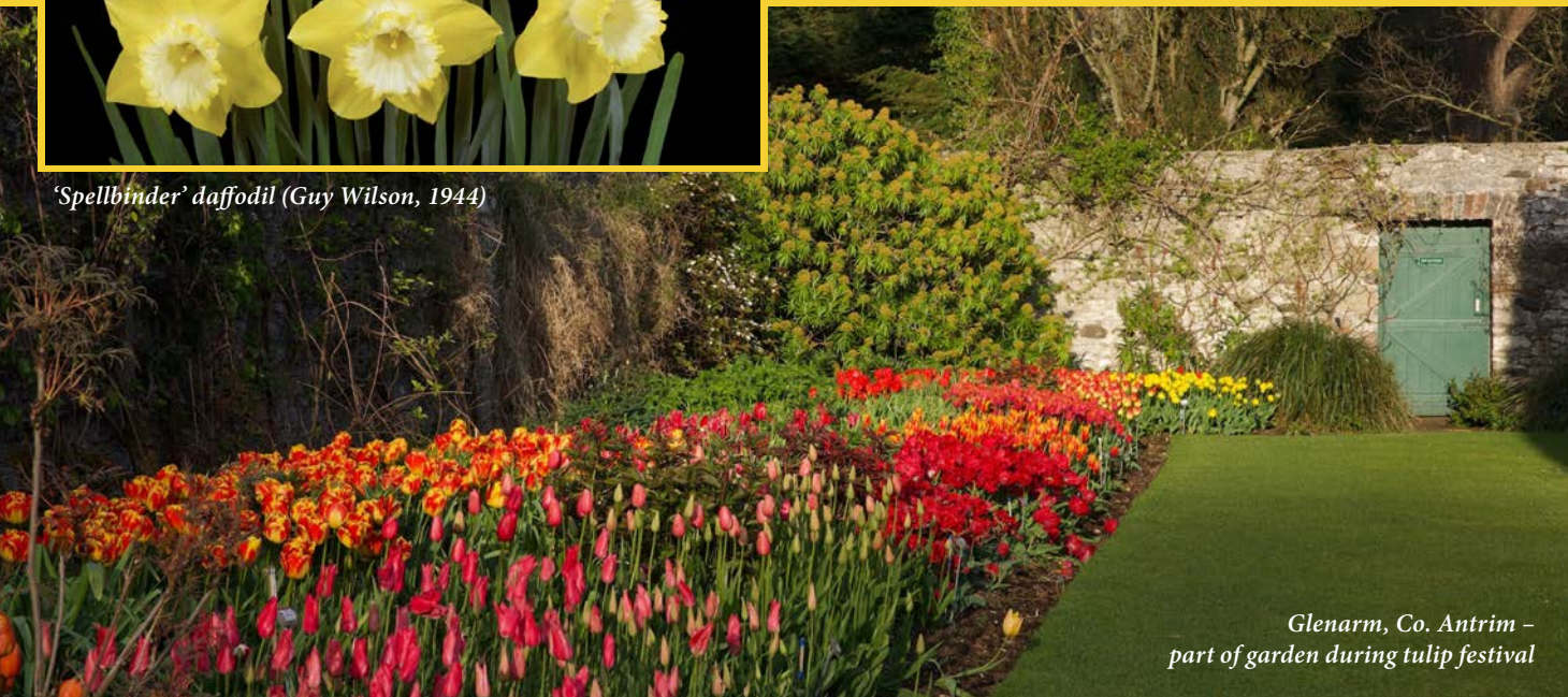
Glenarm, Co. Antrim – part of garden during tulip festival

NORTHERN IRELAND HERITAGE GARDENS TRUST www.nihgc.org